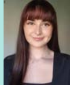
I'm an Education Mental Health Practitioner